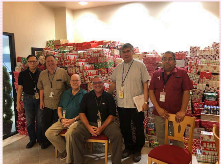
Seafarer Center Chaplains with just a few of the Christmas Boxes that have come in. Chaplains expect to distribute between 10,000 and 11,000 boxes this year.

Reach out, be a blessing and consider the joy that YOUR simple gift will bring to a seafarer from far away.