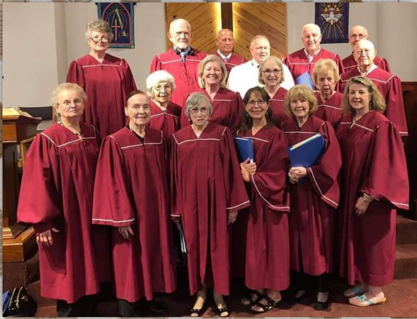
First Presbyterian Church Choir returned to Worship Services in September