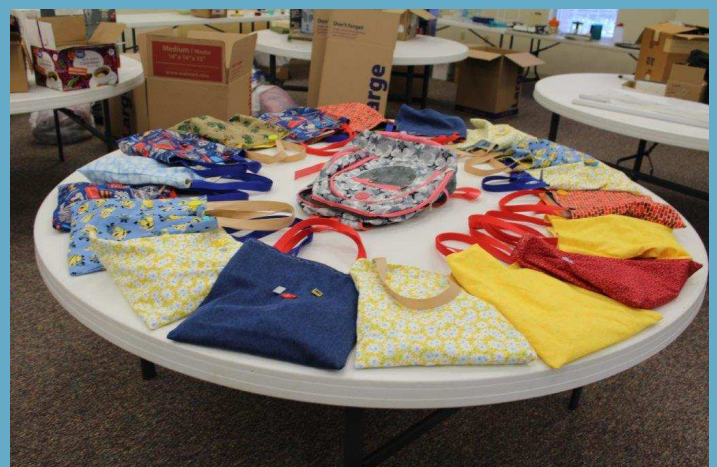
School supply bags made during April Sewing Project