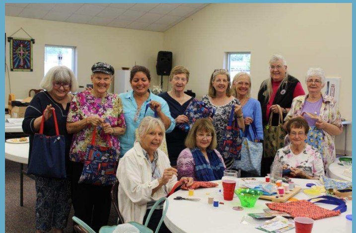
Sewing Project in April 2018, benefitting Hechos Dos Mission Center