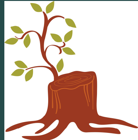
Branch (Tree) of Jesse

Isaiah used the image of a new tree growing from what appears dead to foretell God's redemption of Israel: "A shoot will come up from the stump of Jesse; from his roots a Branch will bear fruit" (Isaiah 11:1, NIV). During Advent, this prophecy assures us of the coming of the Messiah, descended from King David, and thus his father, Jesse.